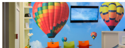
MPI™ 8024 Wall Film EA Hi-Tack