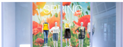
MPI™ 8621 Wall Film Removable