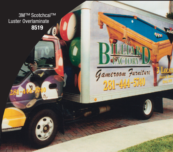
3M™ Scotchcal™ Luster Overlamine 8519